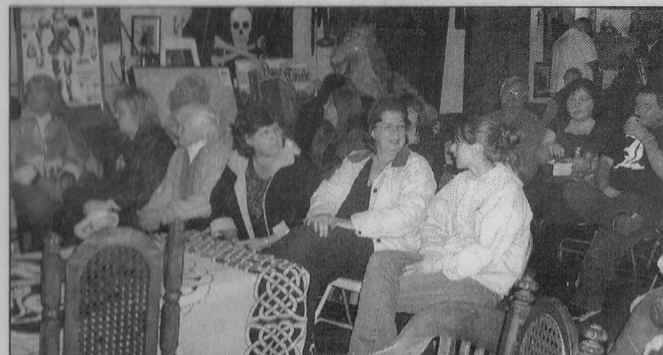
The crowd gathers in the castle to listen to the presentation.

The Mainliner • The Mountaineer-Herald • The Mainline Extra The Star-Courier • The Journal • The Dispatch